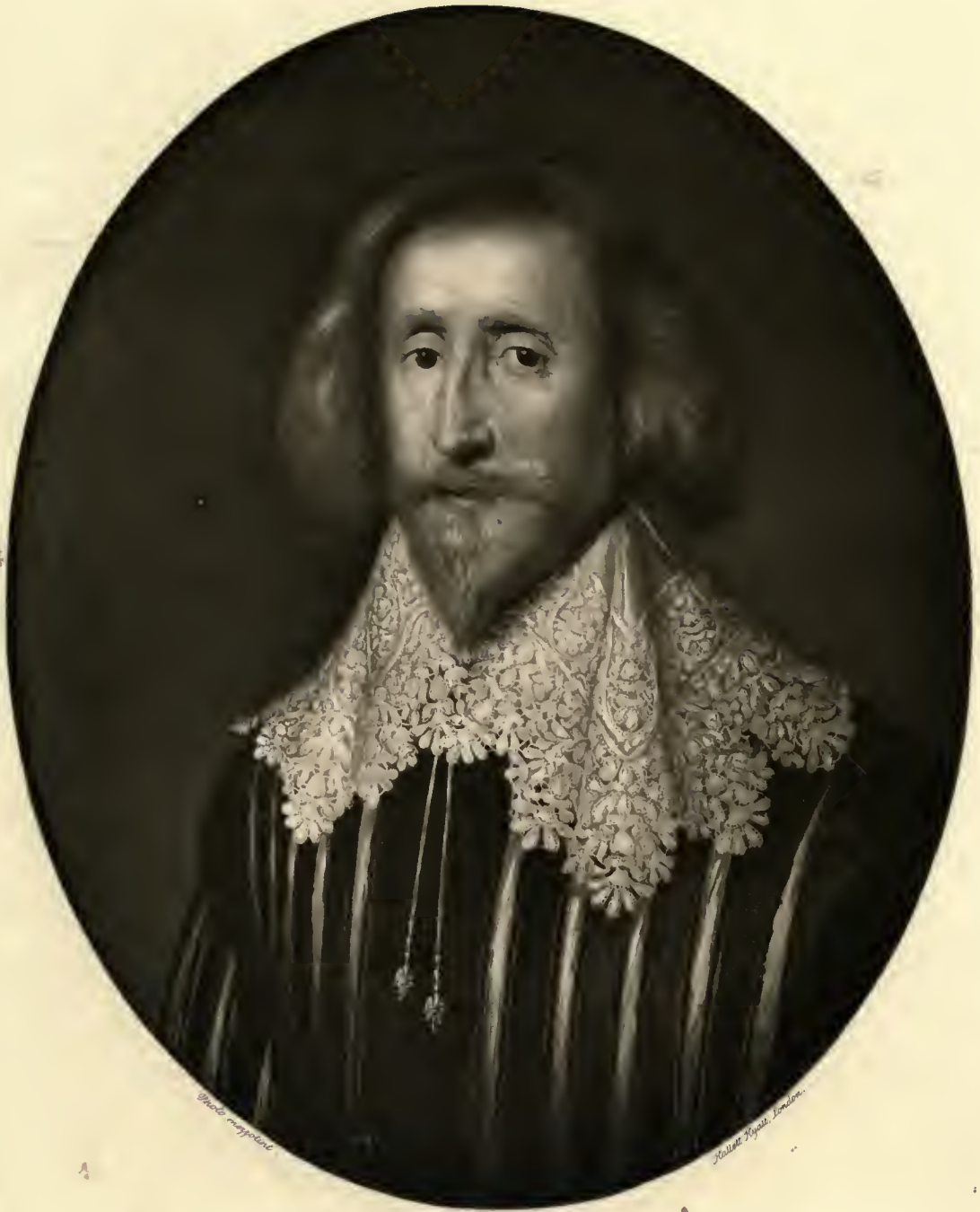
George Sandys. from the painting by Cornelius Janssen.